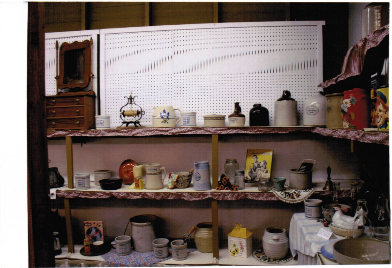
RED WING POTTERY COLLECTION