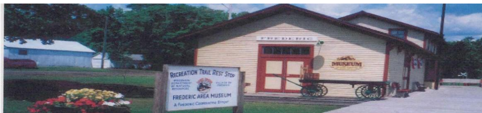
Frederic Soo Line Depot Museum