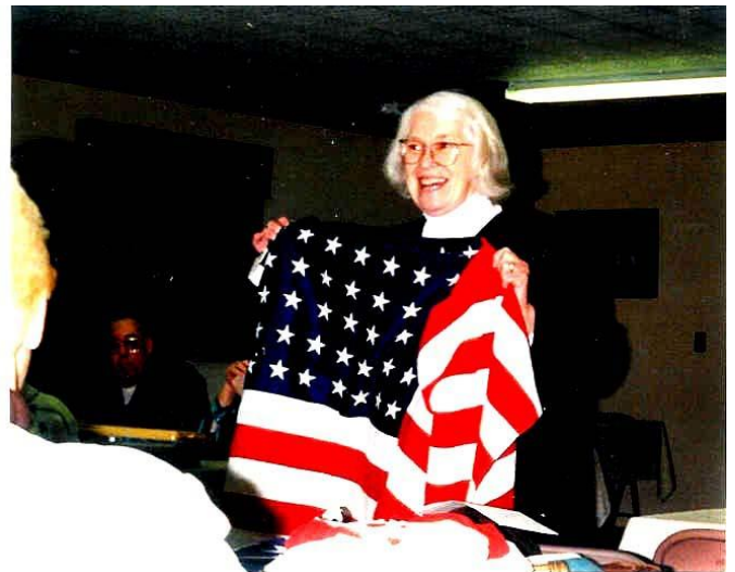
MARCH IS NATIONAL WOMEN'S HISTORY MONTH