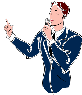
Local History Speakers