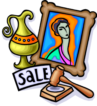
Auction June 30