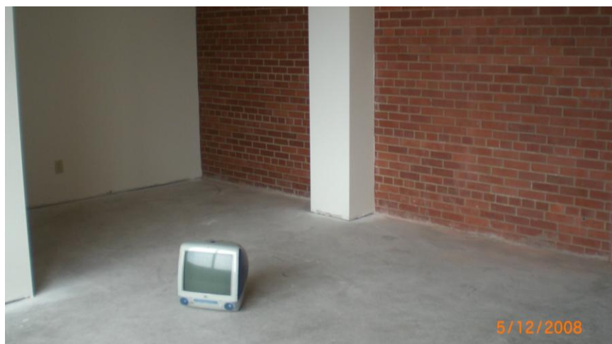
Polk County Historical Research Library

The Polk County genealogists will staff the new Museum Research Library, located on the third floor of the new addition, every Monday from 1-4 p.m. in June, July, and August. They will be available to assist in helping others locate family history data in the records available.