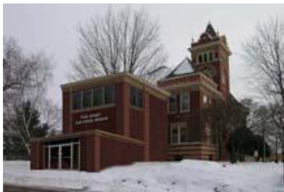
Box 41 Balsam Lake, WI 54810