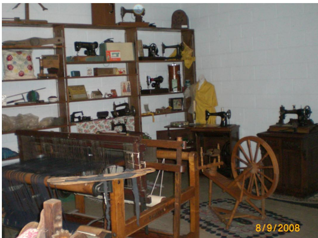
A great display of tools used in the home in bygone years.