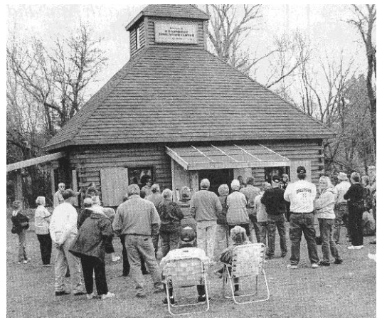
D.D. Kennedy Park Educational Center