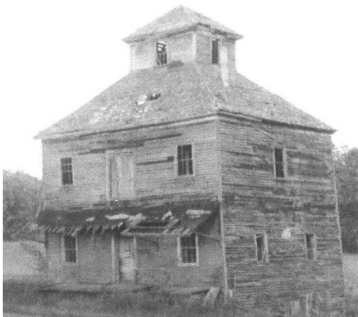
Deteriorated Kennedy Mill – 1970's